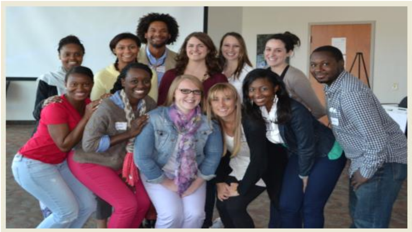
Photo: Current MPH students who participated in the Chester County African American Youth Empowerment Workshop on April 6, 2013