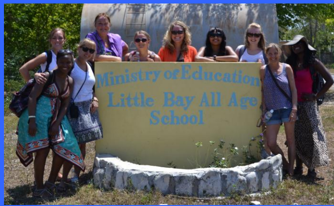
Photo: MPH Faculty and Students at Little Bay All Ages School

Located in the parish of Westmoreland, Little Bay Jamaica is a quaint, small, fishing, farming and hands craft community in the southwestern coastal region of Jamaica. The community of Little Bay is a close knit group of multiple extended families who rely on kinship and strong, family ties for support, guidance and economic survival.