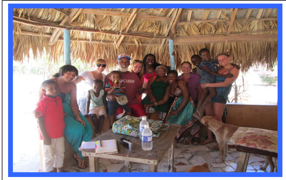
Photo: MPH students conduct Ethnographic Interviews with community residents of Little Bay Jamaica

As final projects, students write reflective journals on their experiences, combining class insights with field observations and students make presentations to offer their insights from the immersion course during the trip. Student reflections on the course were positive. Students reported that they learned a great deal about themselves, the community of Little Bay Jamaica and that the entire experience was “transformative and life changing.” Leaving Little Bay Jamaica was difficult, but the memories made and experiences shared will stay with each and every one of the students and teachers for a lifetime. For as much as the students of Little Bay All Ages learned from the MPH students’ health literacy lessons, the MPH students learned even more about themselves as public health professionals and the importance of cultural competence. In the words of Dr. Seuss, “Don’t cry because it’s over. Smile because it happened”. Leaving Little Bay Jamaica did not mark the end of a service learning course; it marked the beginning of a lasting friendship.