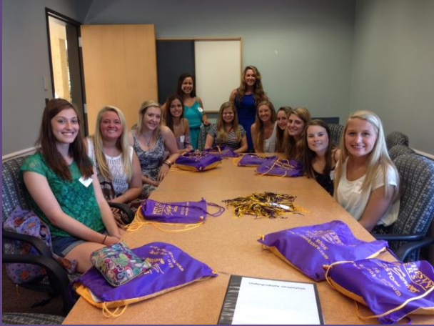
NEW CSD AT WCU 1 ST YEAR STUDENTS ATTEND SUMMER 2014 FRESHMAN ORIENTATION