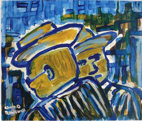
Charles Blackwell, Conversation round 11pm regarding no corruption , Acrylic and ink on Bristol board

An international juried exhibition and sale of art and fine crafts by artists with disabilities