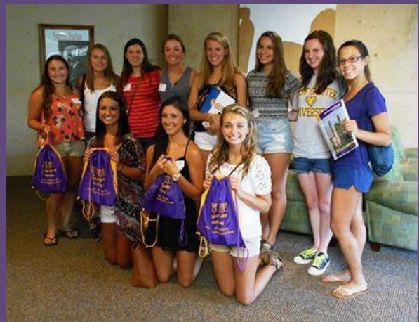
NEW CSD AT WCU 1 ST YEAR STUDENTS ATTEND SUMMER 2014 FRESHMAN ORIENTATION