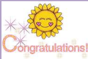
CSD AT WCU DEAN'S LIST STUDENTS SPRING SEMESTER 2014