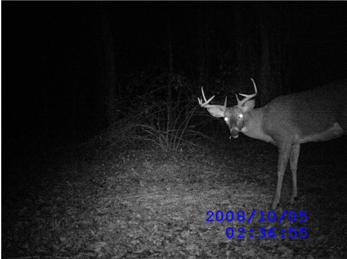
Figure 1. Photograph of a uniquely antlered buck captured by an infrared-triggered camera during baited infrared camera surveys conducted by USDA APHIS Wildlife Services to estimate white-tailed deer abundance on the Robert B. Gordon Natural Area at West Chester University, Chester County, PA during September and October 2008.