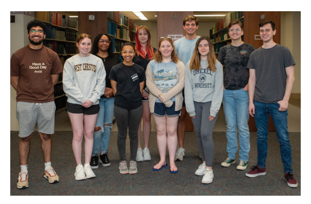
Participants in the 2023 Summer Undergraduate Research Institute (SURI)