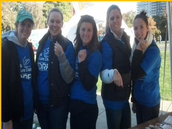
NSSLHA members show their JDRF Walk t-shirts and walker numbers on the day of the walk.

FRIDAY NOVEMBER 22 NSSLHA COFFEEHOUSE FUNDRAISER FENNARIO'S COFFEE SHOP 111 NORTH CHURCH STREET WEST CHESTER 7:45 p.m. to 10:00 p.m. SEE YOU THERE!