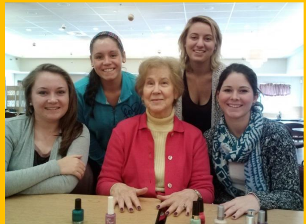
NSSLHA members volunteer at a local center for older adults.