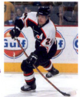
Sami Kapanen of the Philadelphia Flyers

Members of the HEAT Institute are currently working with the Philadelphia Flyers organization. They completed a two-week series of data collections with the ice hockey players during their pre-season training camp in 2006, including the collection of core-temperature and sweat-rate data during a pre-season game. As with the on-going investigations in professional football players, this is the first such research in the world involving thermoregulation and electrolyte balance in professional ice hockey players. The HEAT Institute has continued with numerous investigations during the 2006-2007 NHL season and currently the research has expanded to include the use of the VivoMetric's LifeShirt technology.