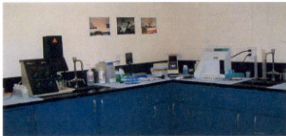
Heat Institute biochemistry laboratory

The HEAT Institute is dedicated to conducting independent research related to the evaluation, avoidance and treatment of heat-related illness in athletes. We are committed to raising funds from sources not associated with a corporation that could benefit from this on-going research. The HEAT Institute is interested in collaborating with individuals and private foundations seeking to support and promote independent and unbiased research on thermoregulation and body fluid balance in athletes at risk for heat illness.