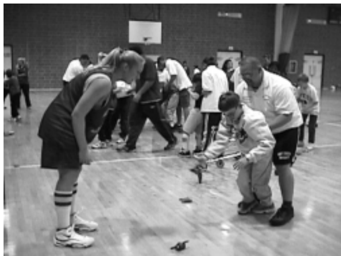
Above: A variety of movement skills, other than ball handling are taught during basketball night.