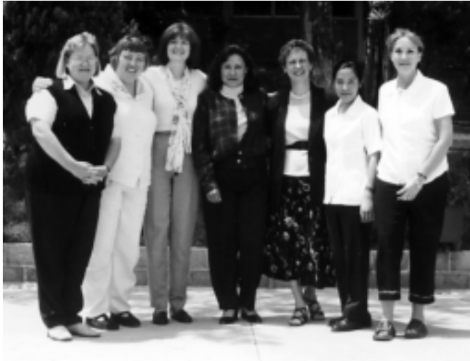
WCU and University of Guanajuato nursing faculty.