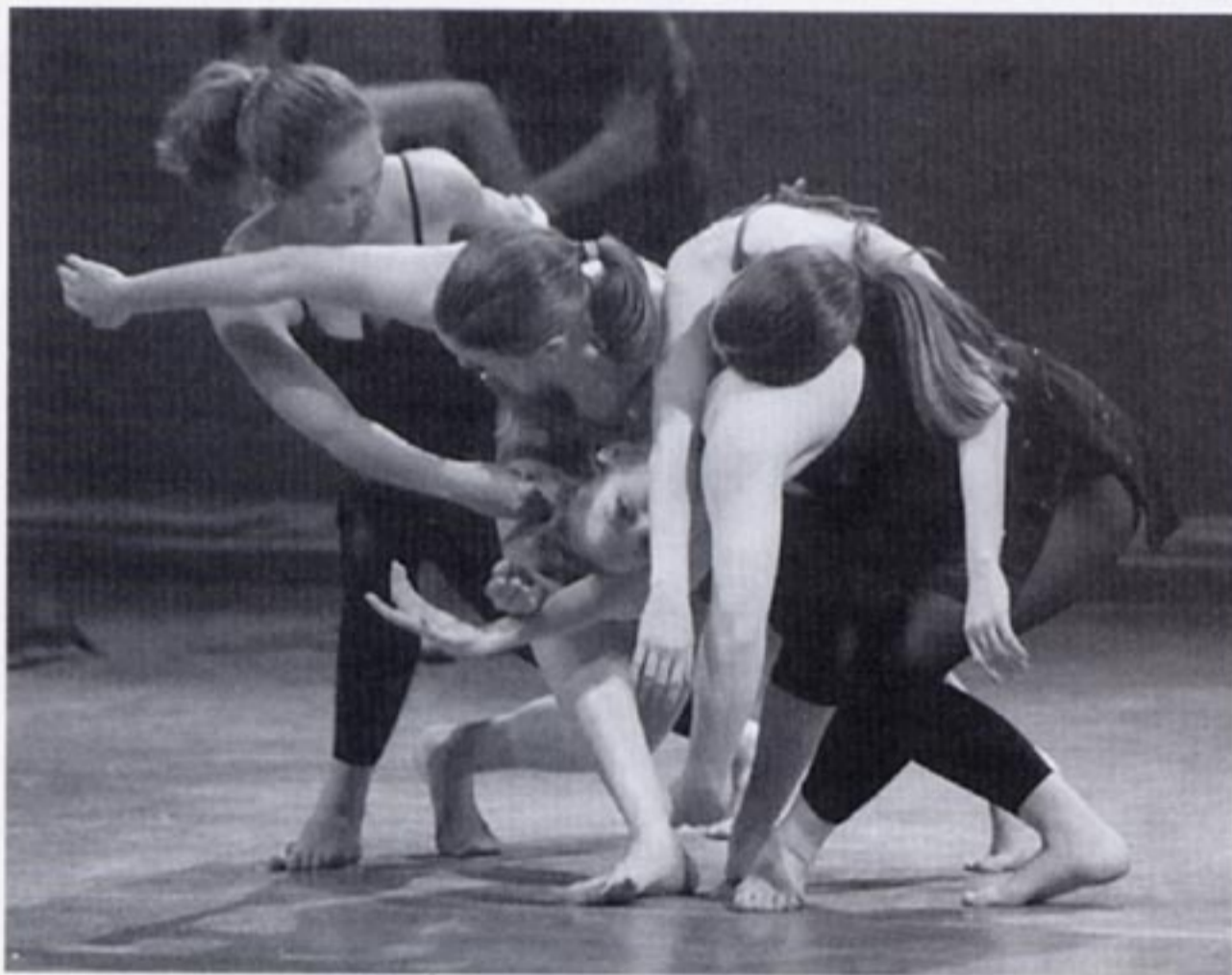
WCU Dance Company—fall 2001 performance.

The renovation work on the Health Sciences Center is progressing satisfactorily. A new athletics equipment room has been completed, as have renovations to the general women's locker area. That allows additional space for renovations on the multi-use activity area and new fitness center. Once those are completed, six new classrooms can be constructed from space in the wrestling room, the current instructional weight room, and the old Department of Health computer lab. The final phase involves converting the remaining six classrooms on the second floor to a Department of Nursing office suite and nursing lab. The plan is for the project to be completed by fall '02. See drawing below.