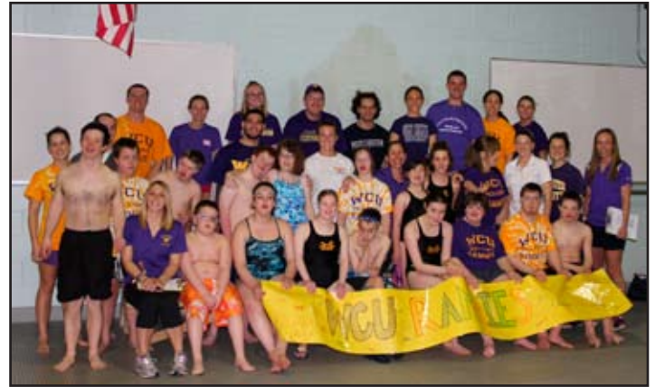
Twenty WCU students accompanied 18 Special Olympics Rammies swim team members to several meets this year, including Widener University Invitational, Southern Chester County Y School Age Meet, West Chester Area Y County Meet, and Bethlehem Invitational.